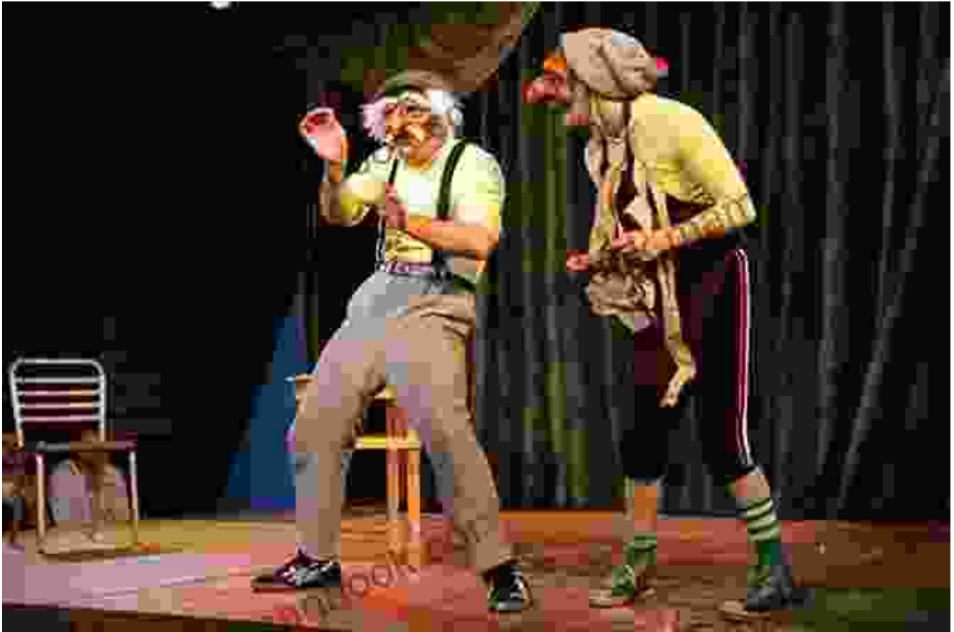
Fig. 2: A scene from "Top Girls" by Caryl Churchill