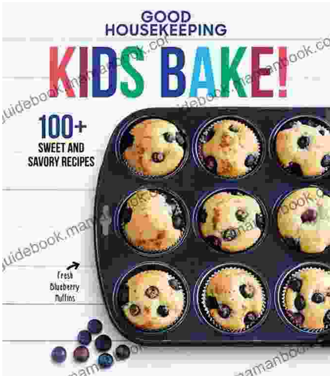
Good Housekeeping Kids Bake!: 100+ Sweet and Savory Recipes (Good Housekeeping Kids Cookbooks)