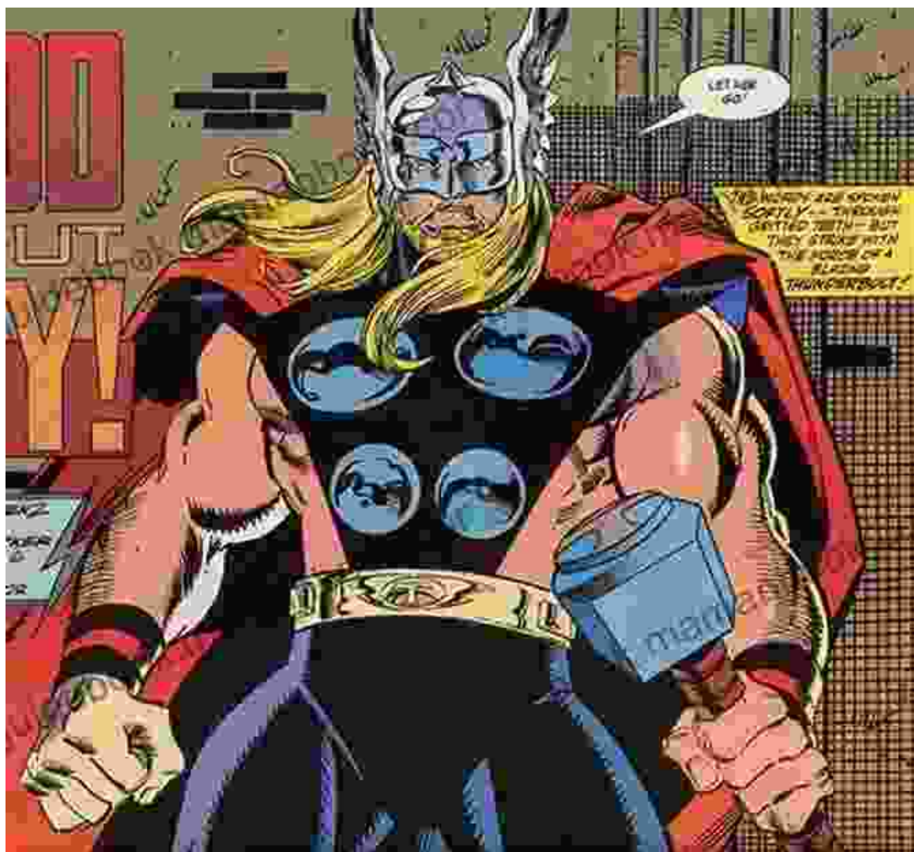
Thor and Eric Masterson, a god and a mortal, united in their quest for justice.

Masterson, an architect who became Thor's human alter ego. Masterson's unique perspective added a new dimension to Thor's adventures, as he grappled with the challenges of balancing his Asgardian heritage with his human life. The 1990s also marked the return of classic villains like Loki and the of new threats like Malekith the Accursed.