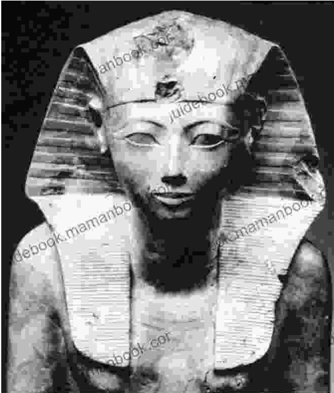
Pharaoh Hatshepsut, a powerful and influential female ruler of ancient Egypt.